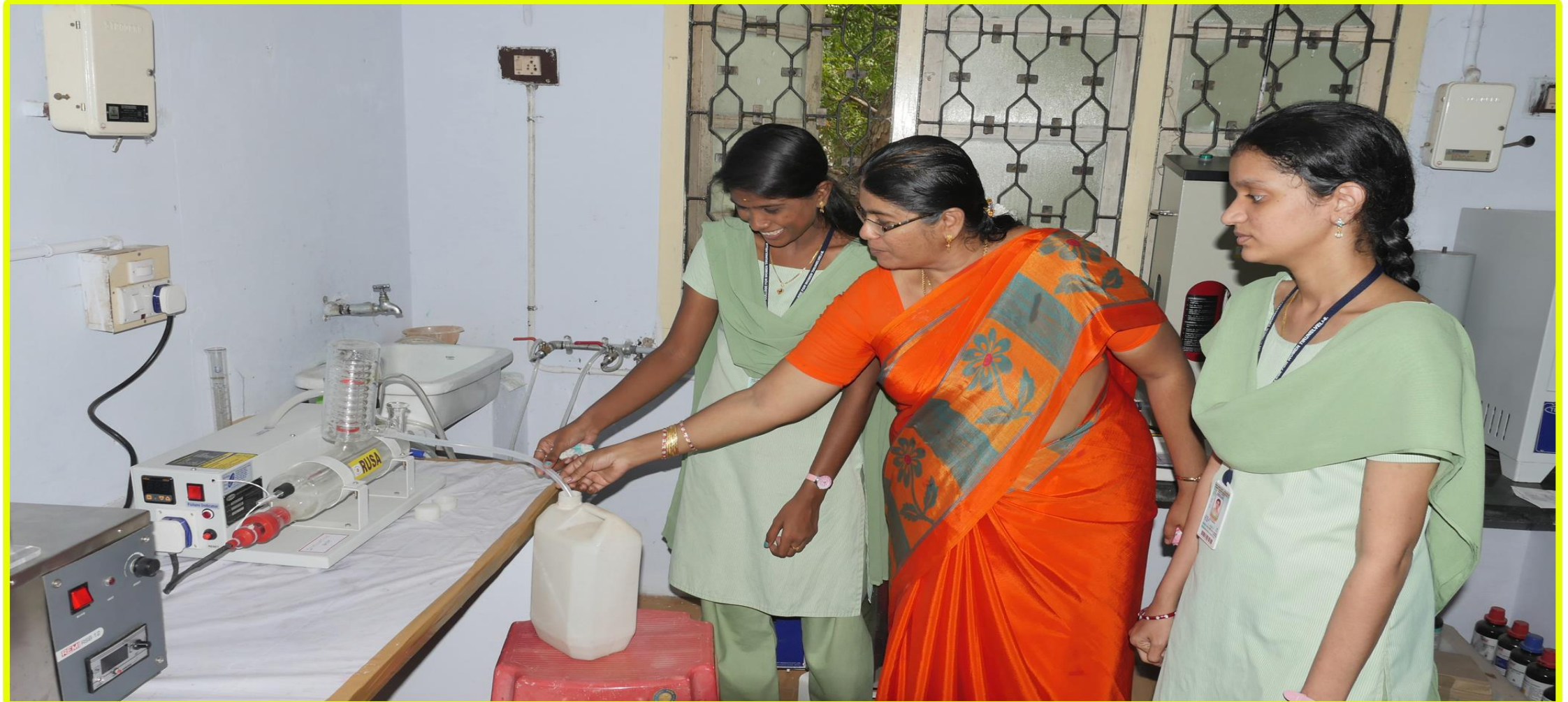
Research Department in Zoology