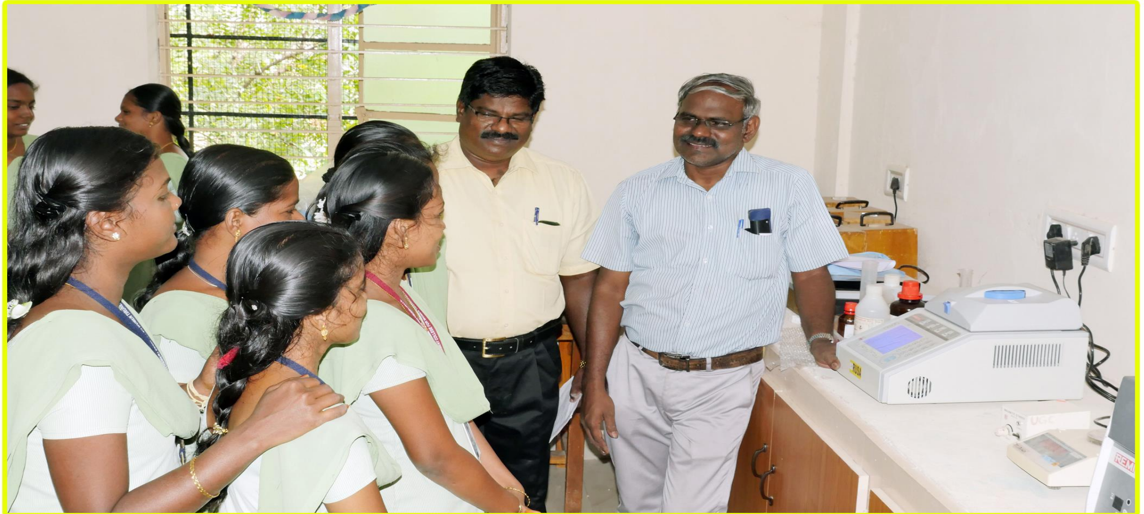
Research Department in Botany