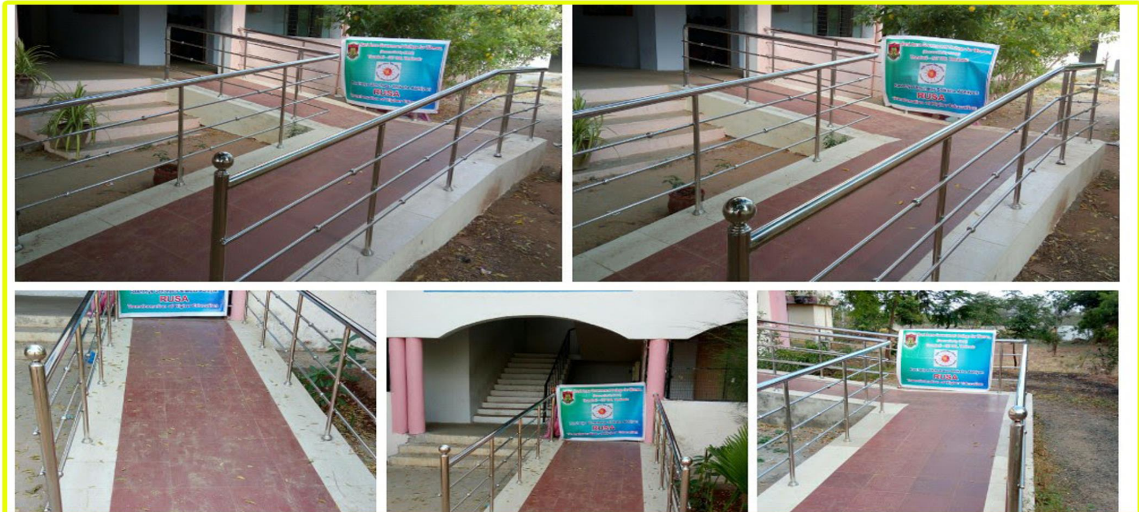
Construction of Ramps