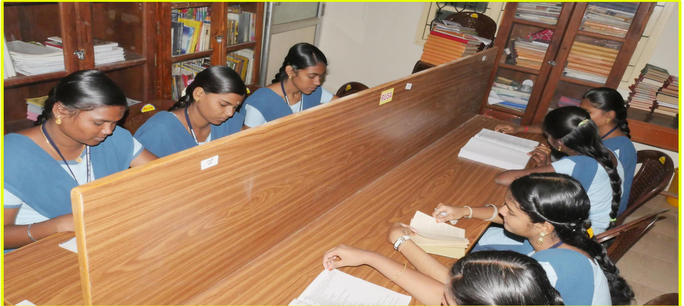
Library Automation and Furnishings