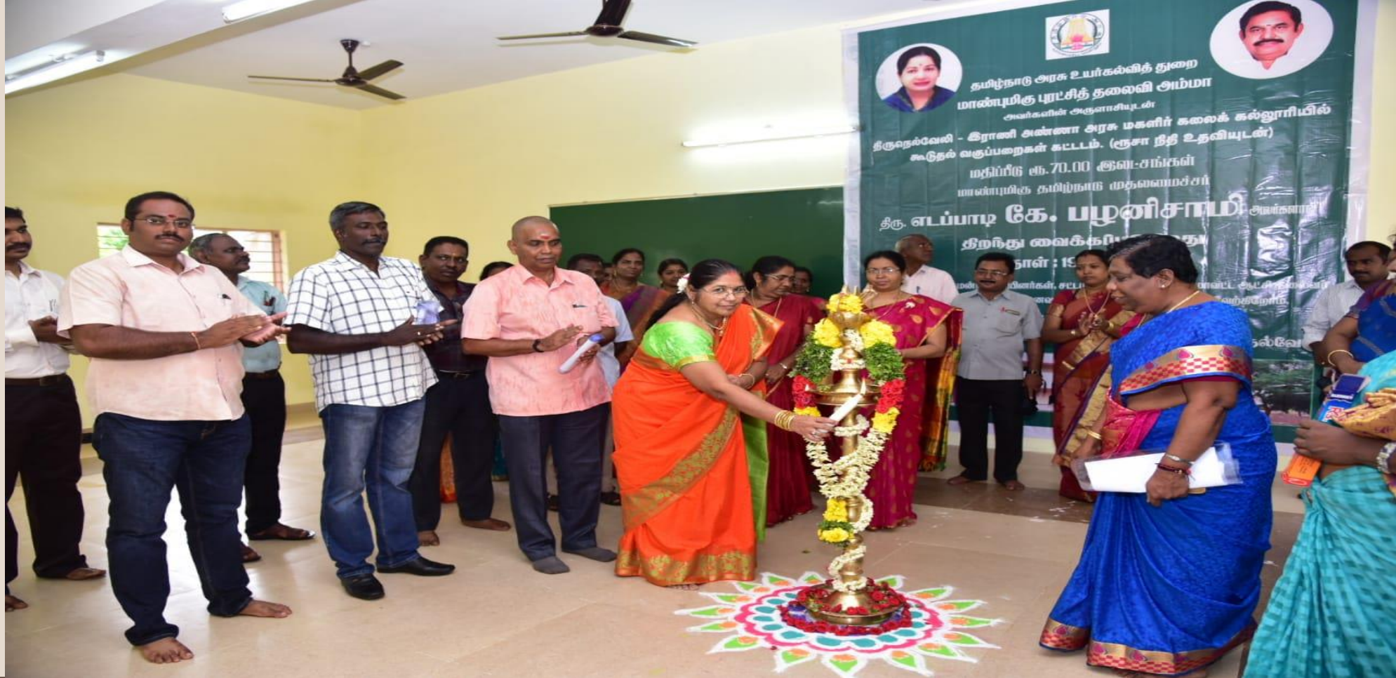
Inauguration of New Classrooms (70 Lakhs)