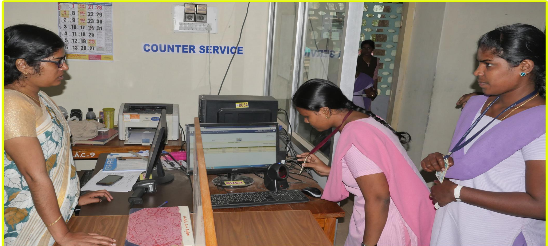
Library Automation and Furnishings