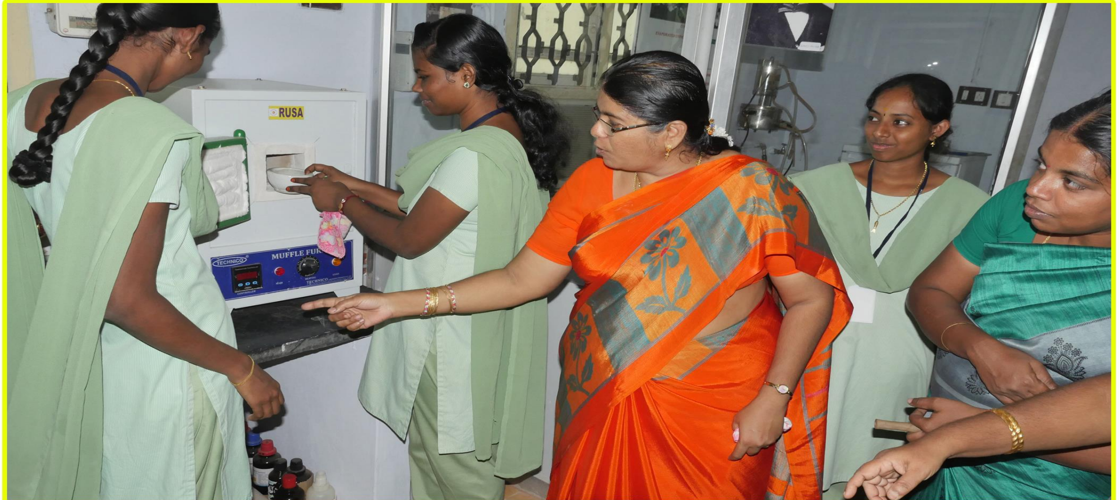
Research Department in Zoology