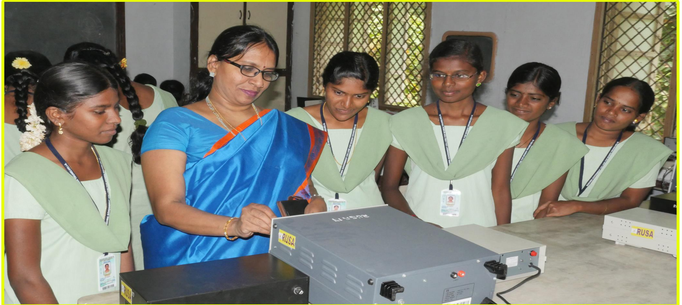
Research Department in Physics