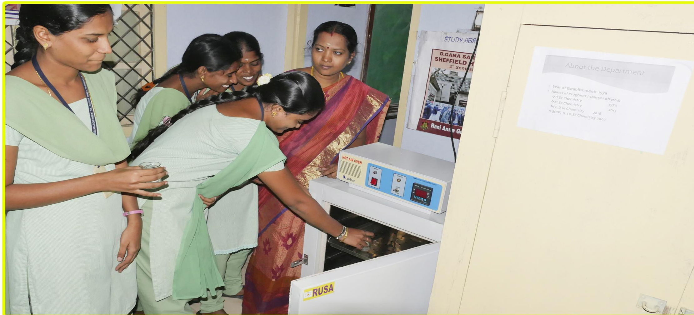
Research Department in Chemistry