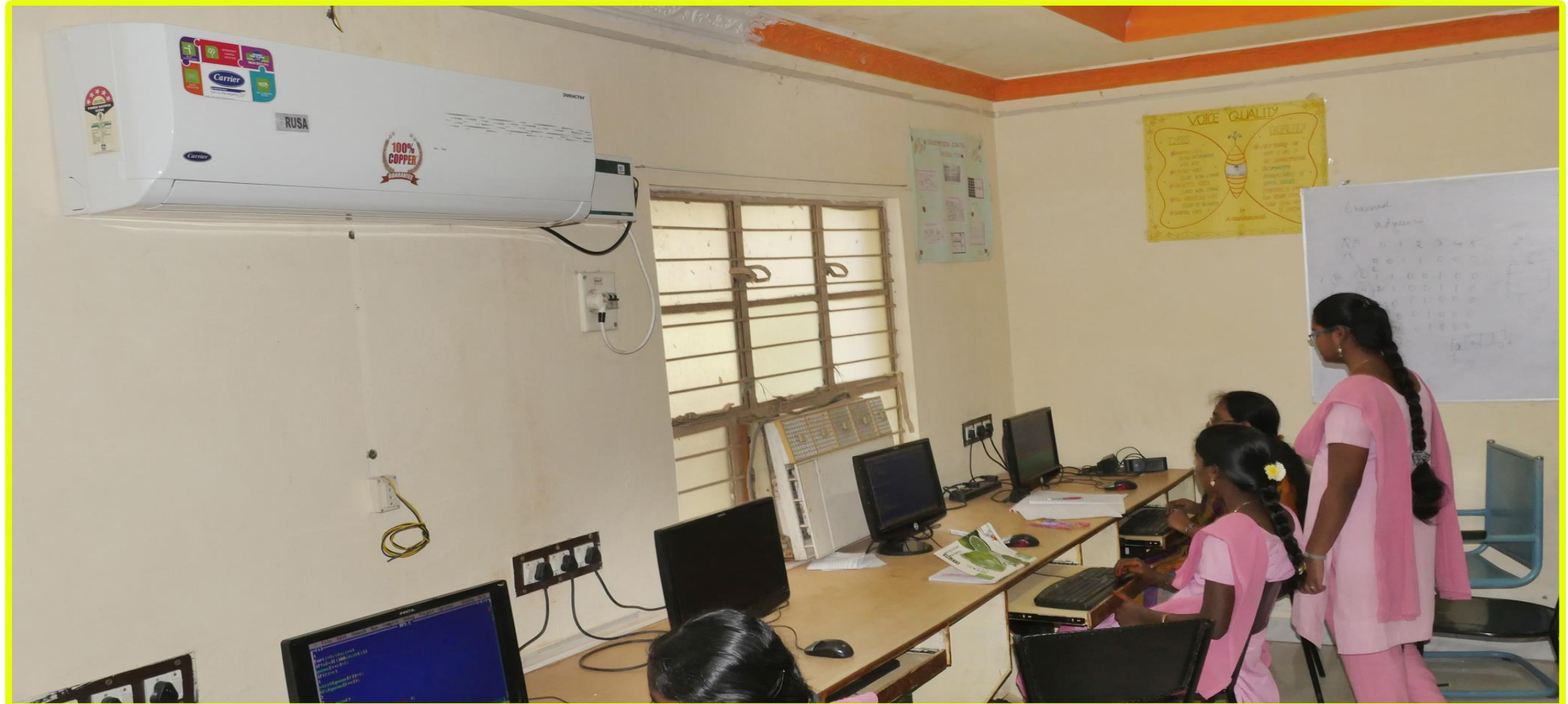
Research Department of Computer Science