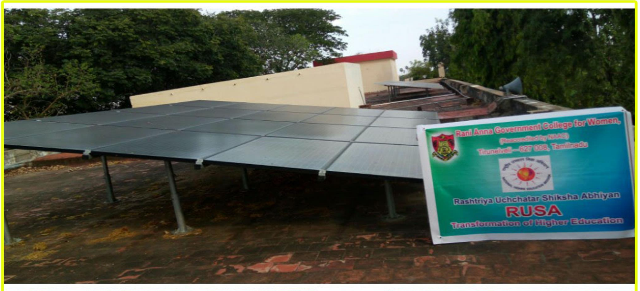
Solar Power Plant