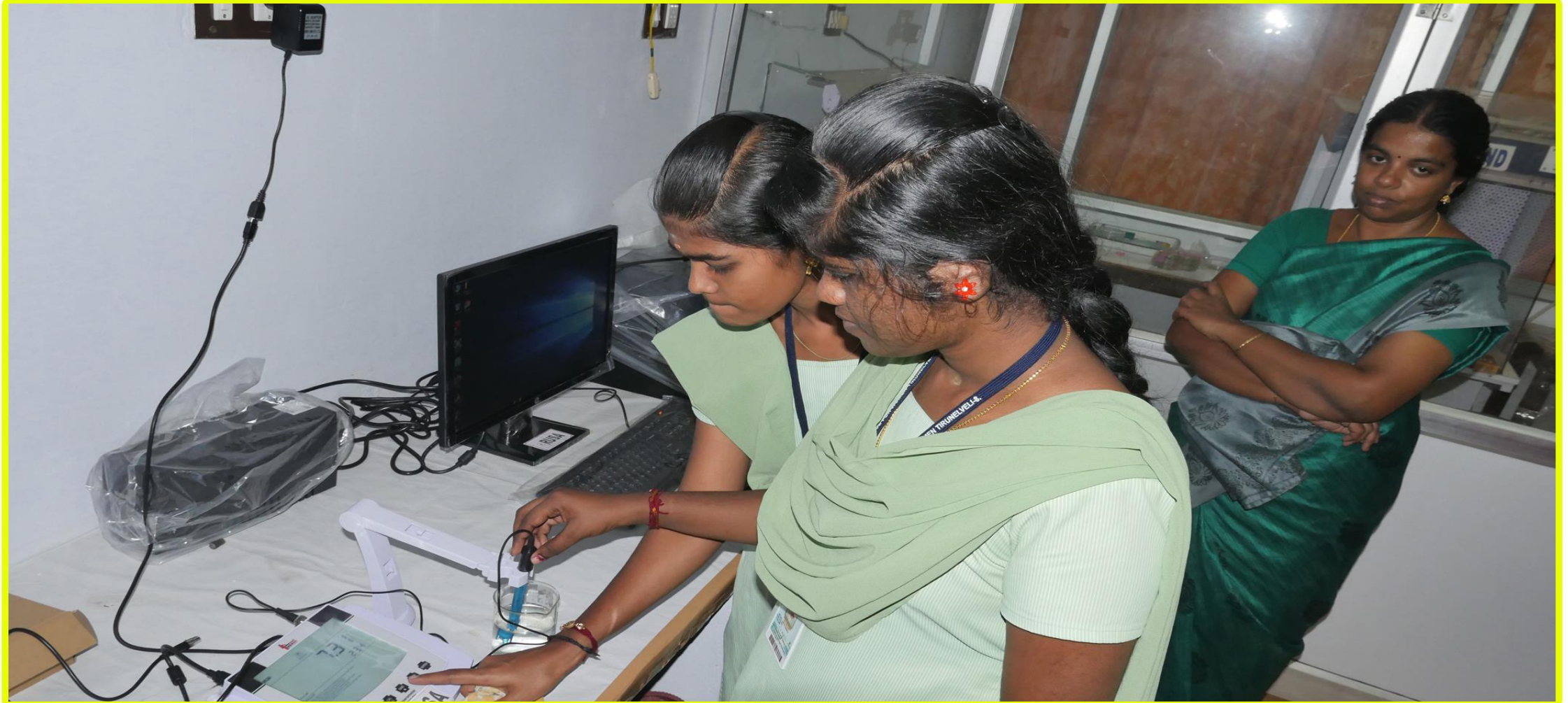
Research Department in Zoology