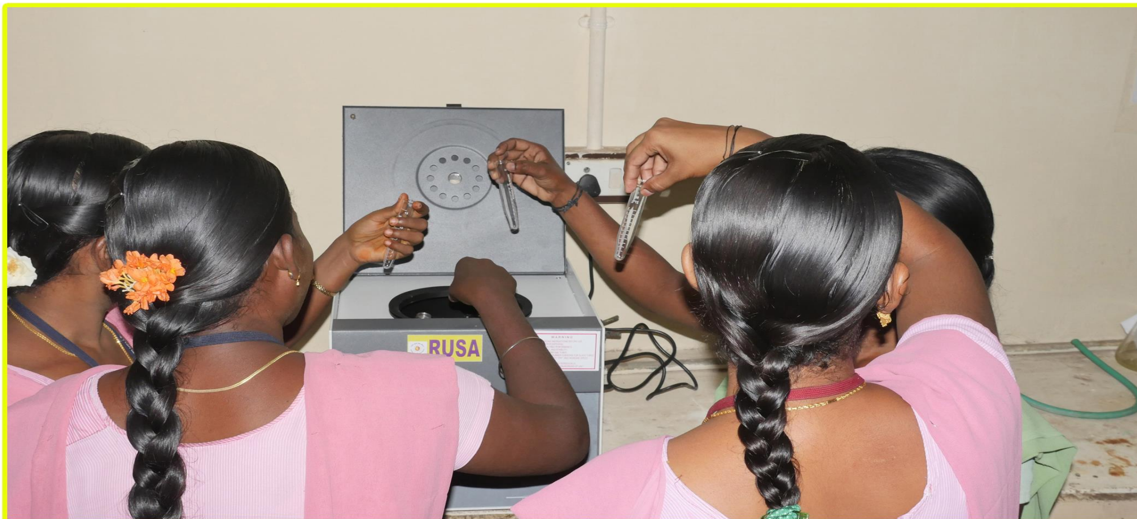
Research Department in Chemistry