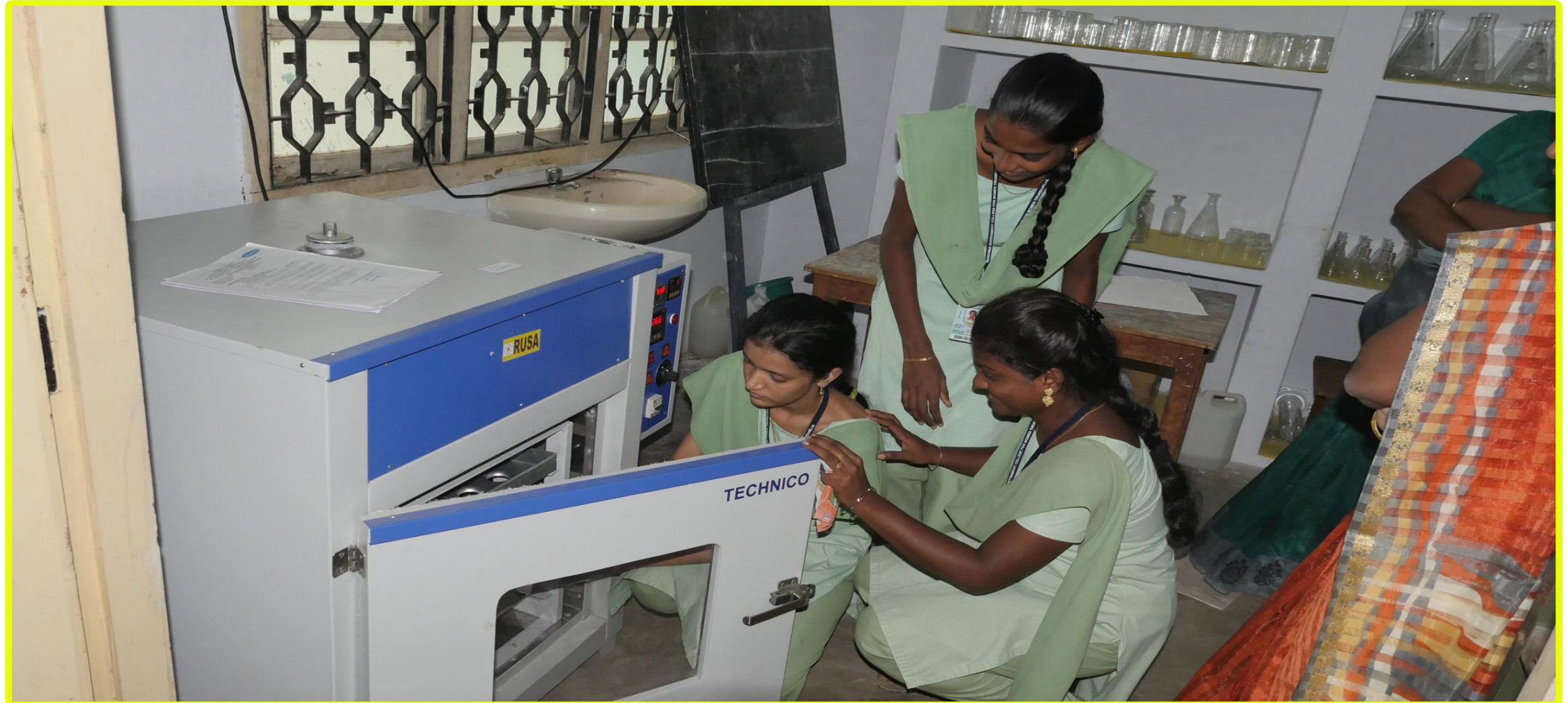
Research Department in Zoology