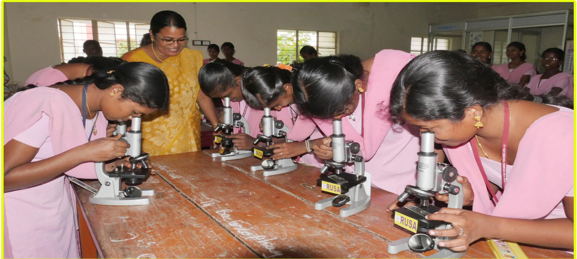
Research Department in Botany