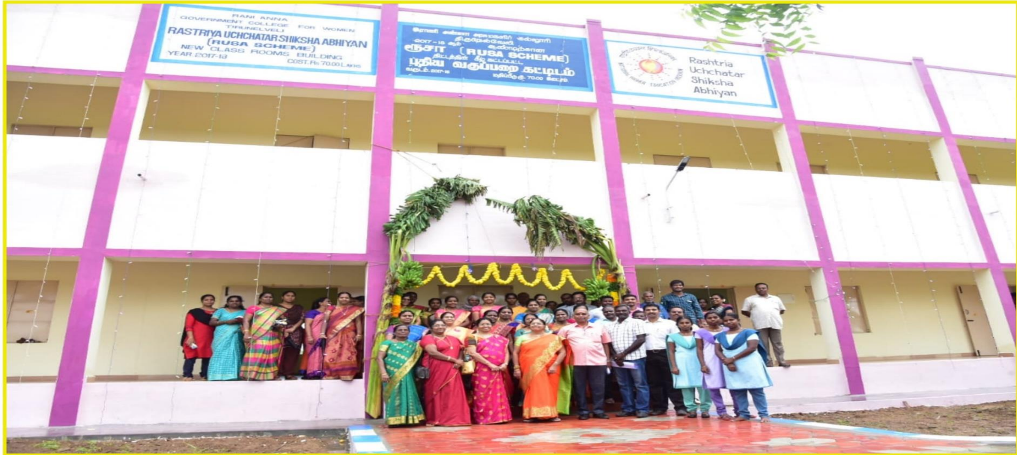
RUSA New Building