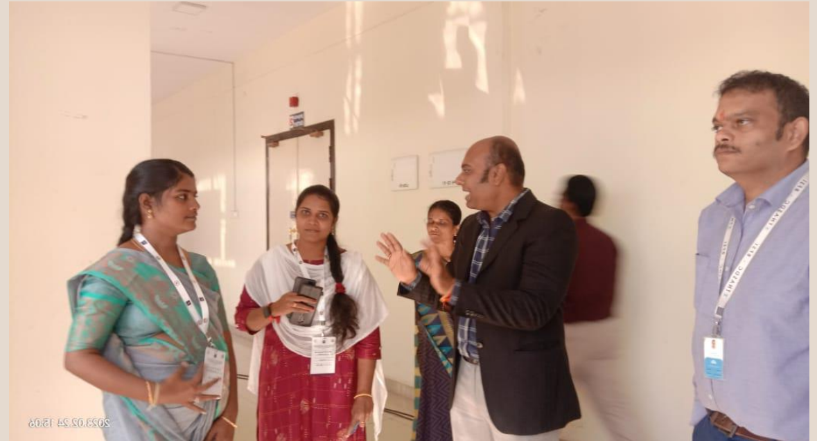
Discussion with Juris