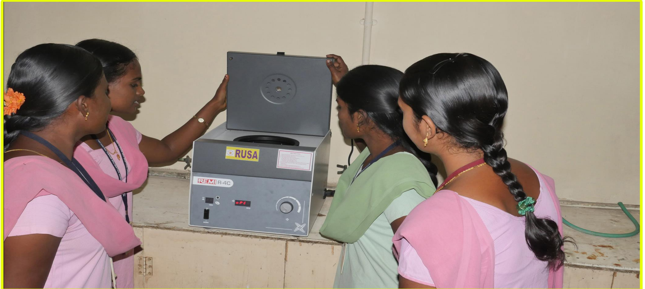
Research Department in Chemistry