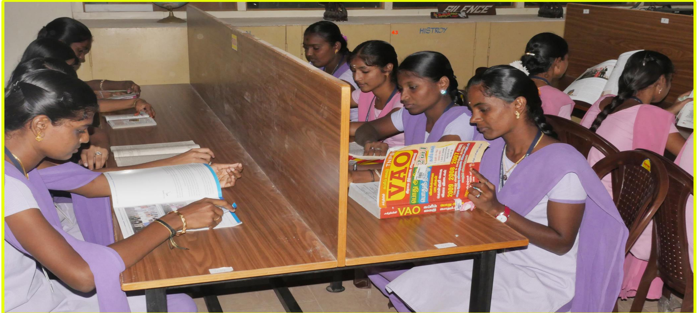
Library Automation and Furnishings