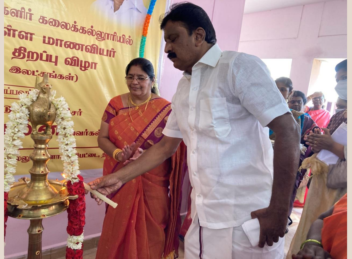
Hostel New Building – RUSA 2.0