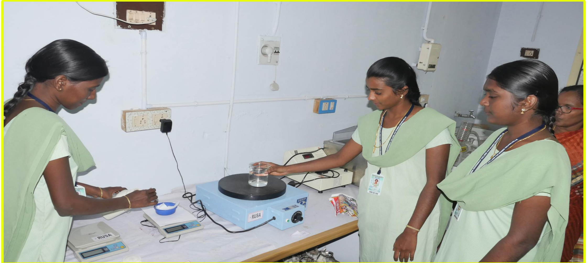
Research Department in Zoology