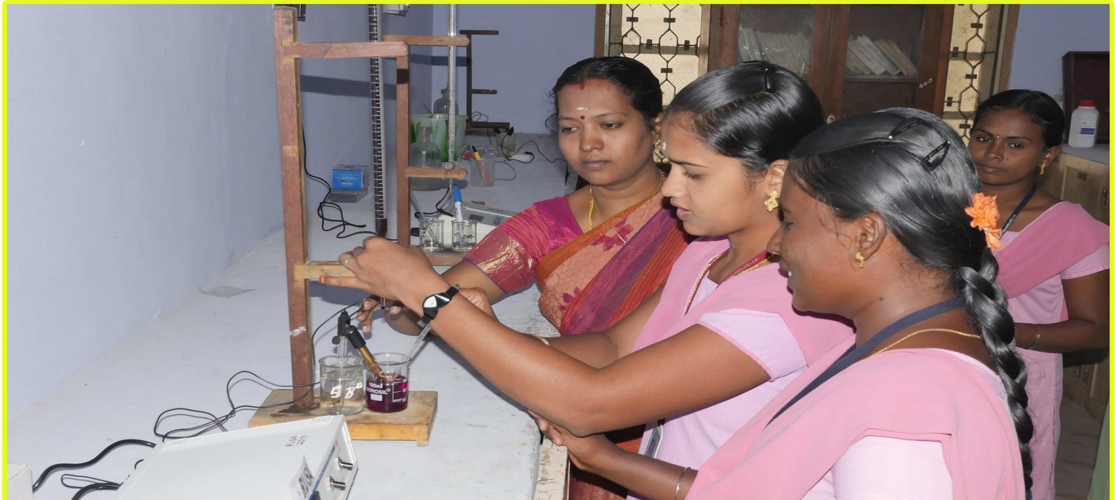
Research Department in Chemistry