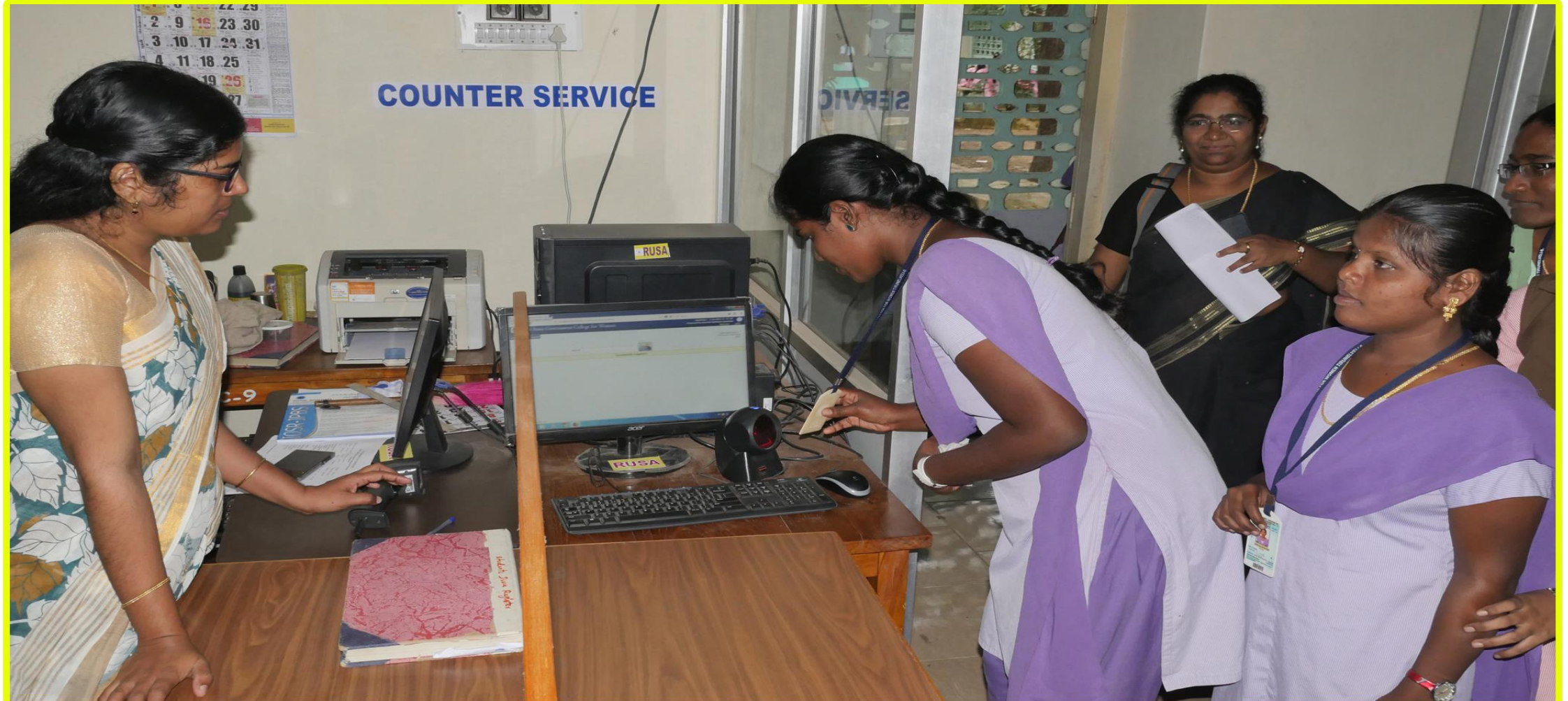
Library Automation and Furnishings