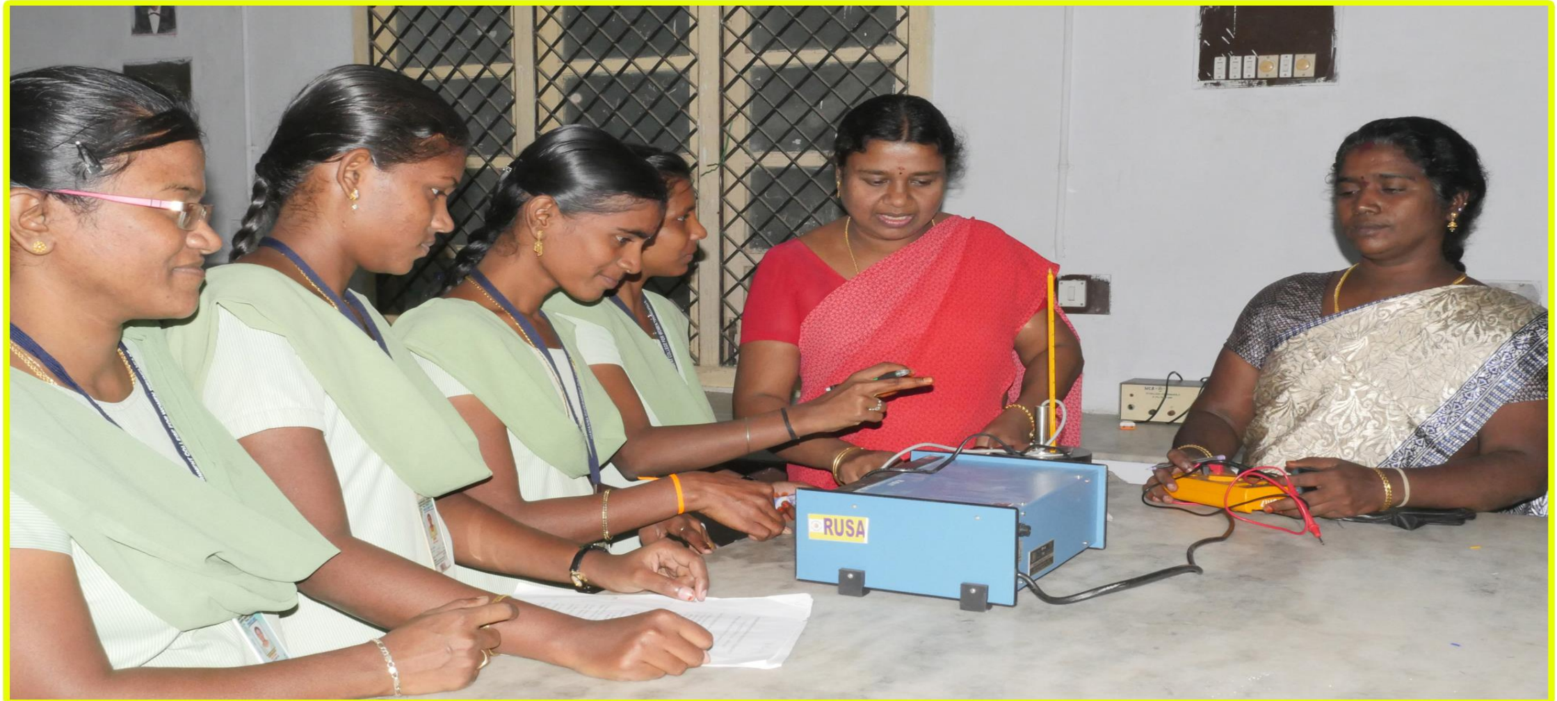
Research Department in Physics