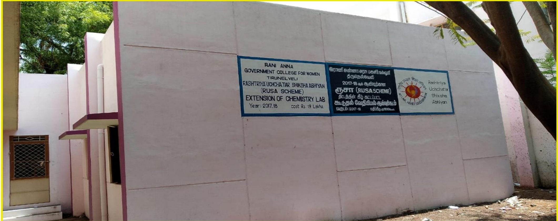
Extension of Chemistry Laboratory