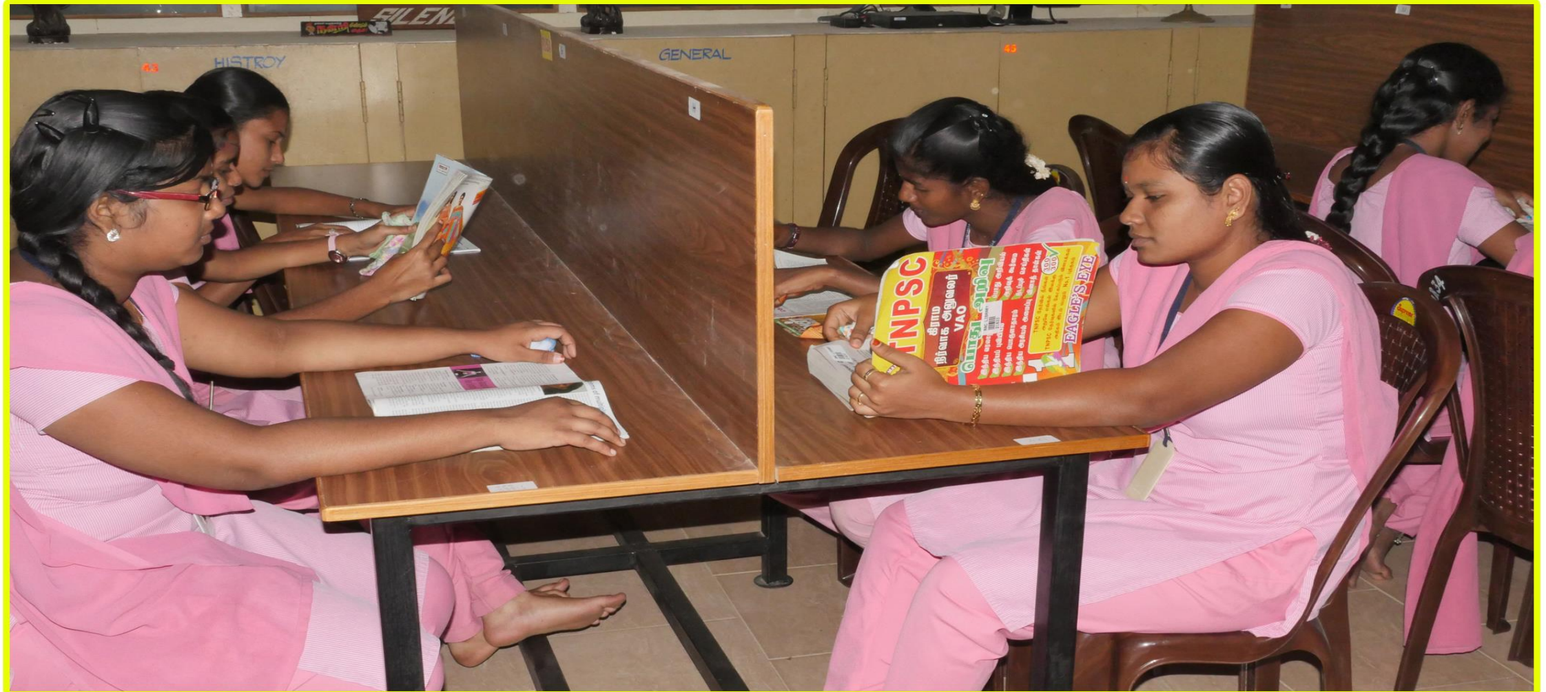
Library Automation and Furnishings