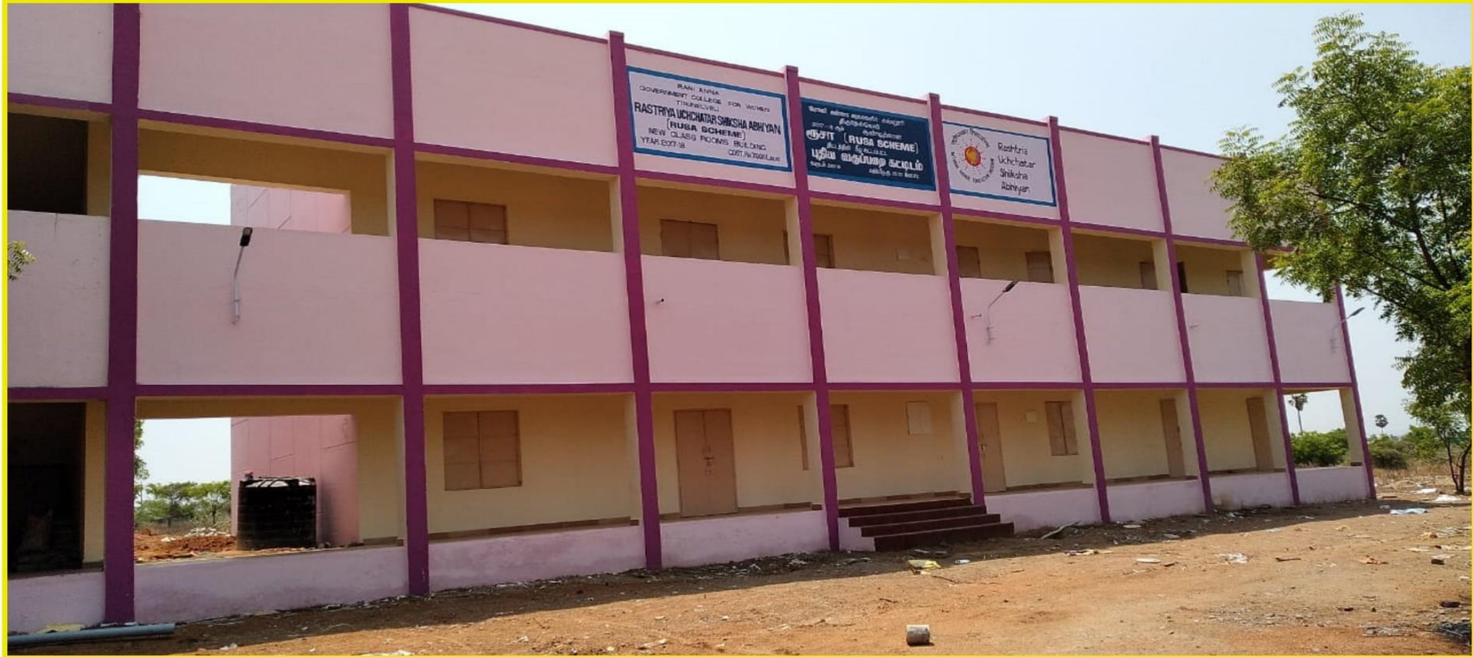
RUSA New Class Rooms