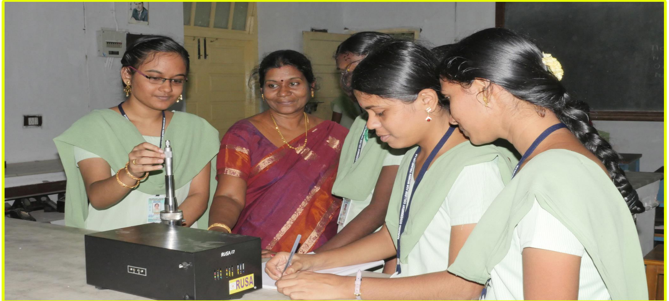
Research Department in Physics