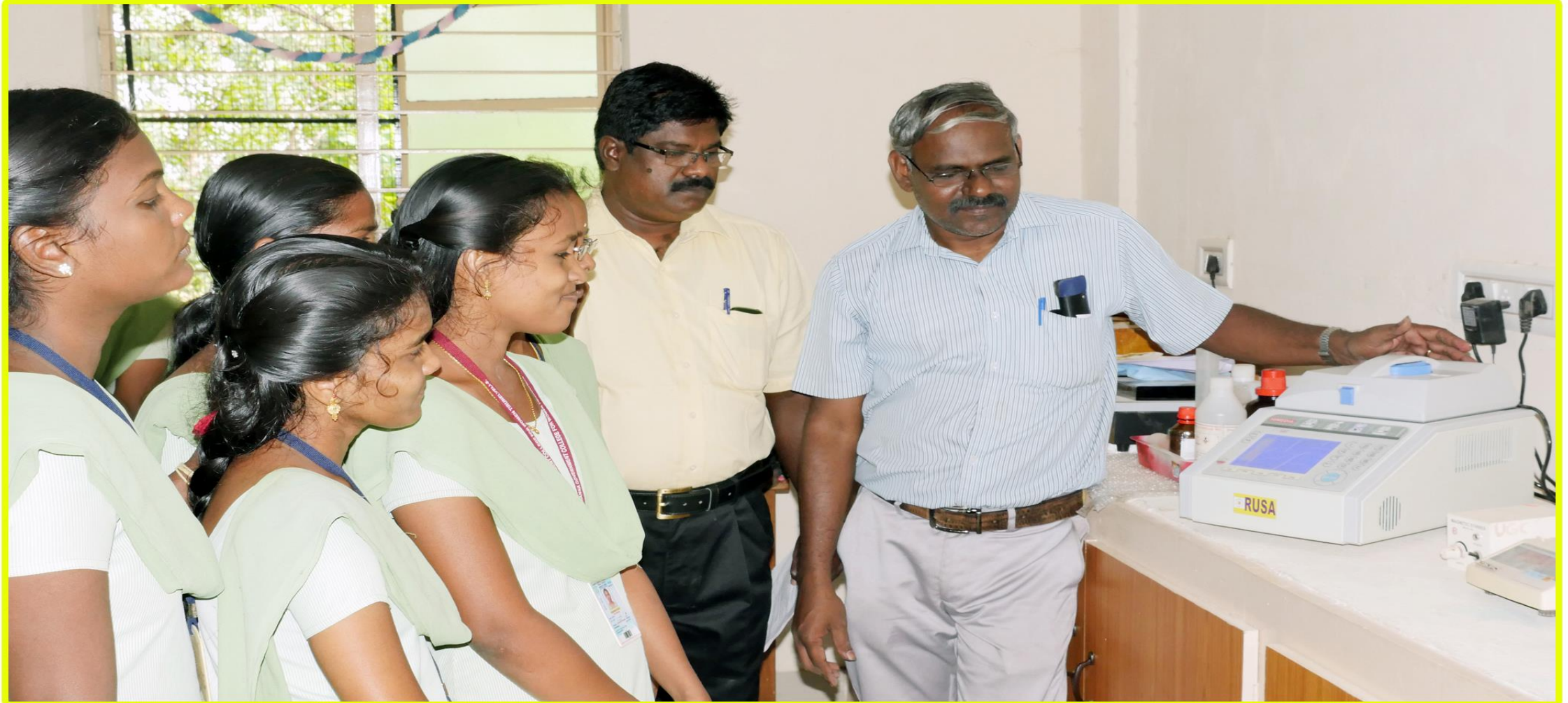
Research Department in Botany