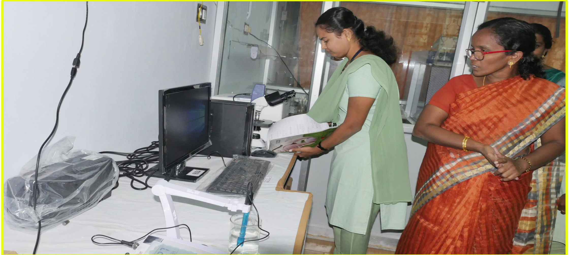
Research Department in Zoology