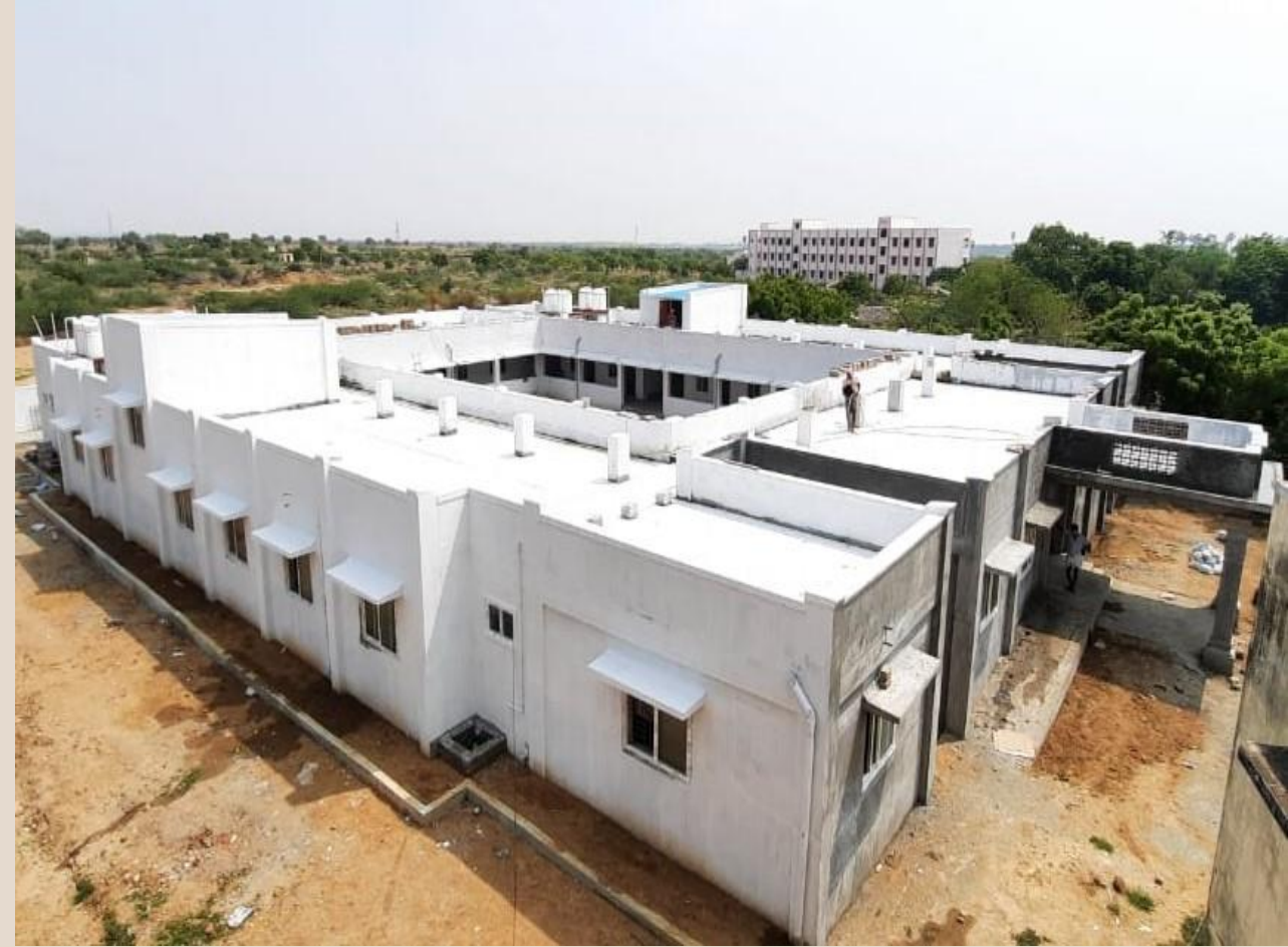
Hostel New Building – RUSA 2.0