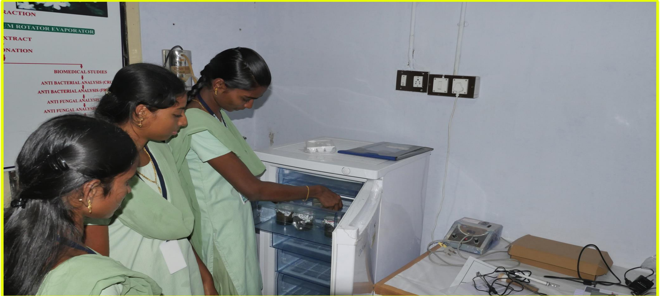
Research Department in Zoology