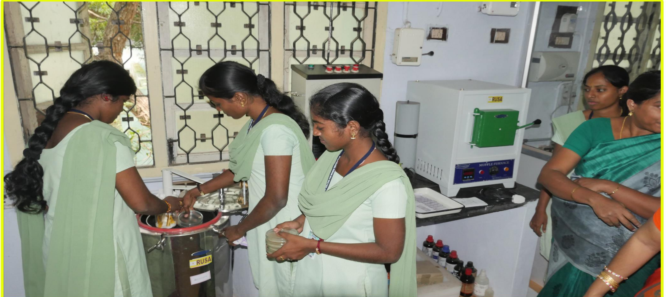
Research Department in Zoology