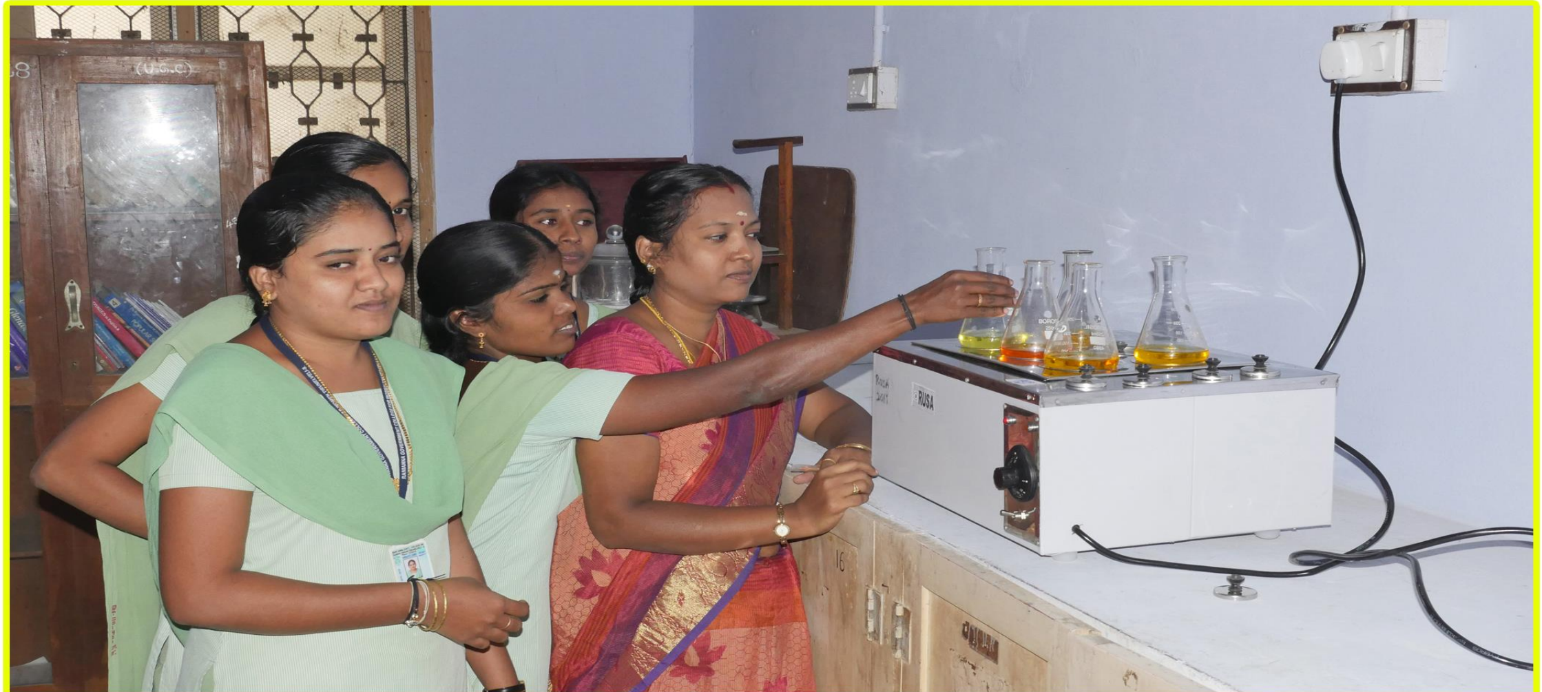
Research Department in Chemistry