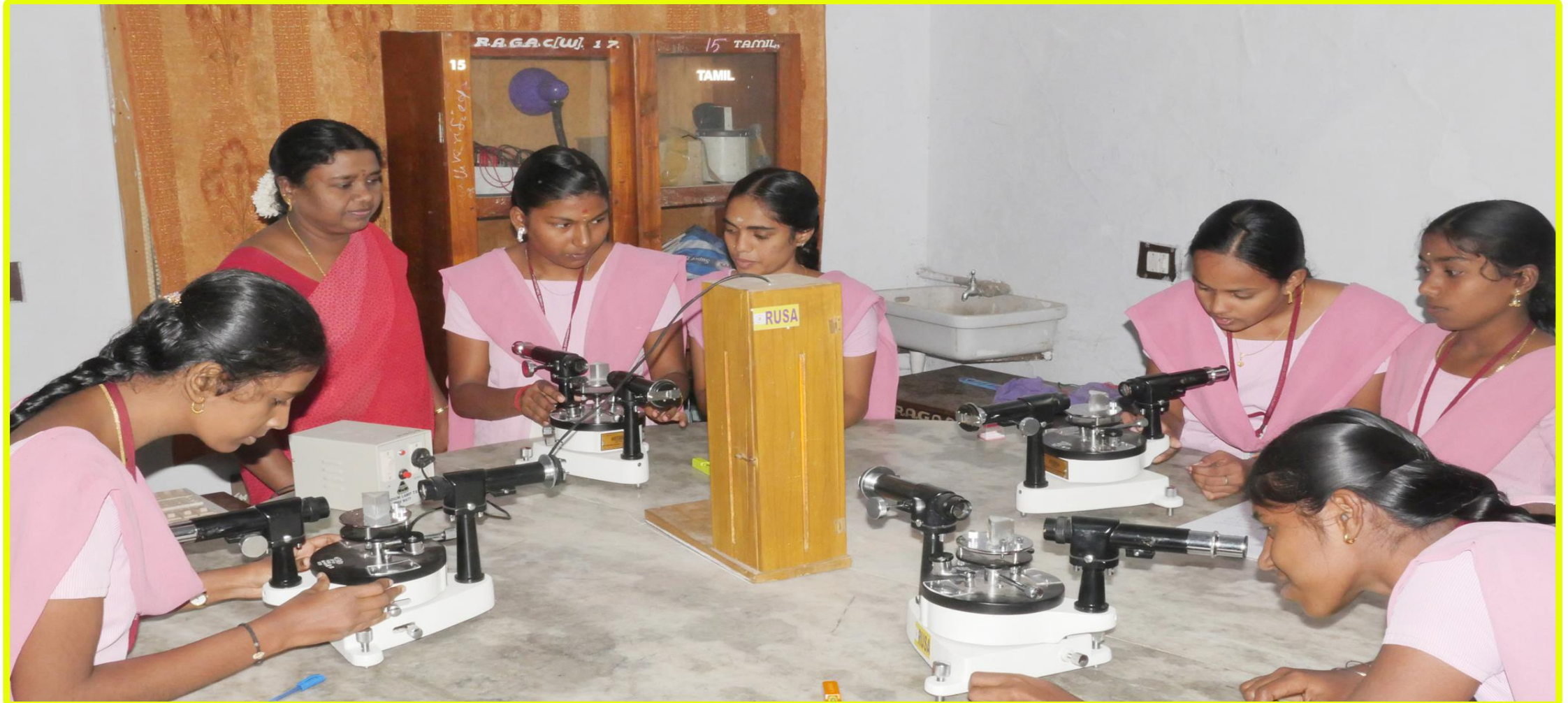
Research Department in Physics