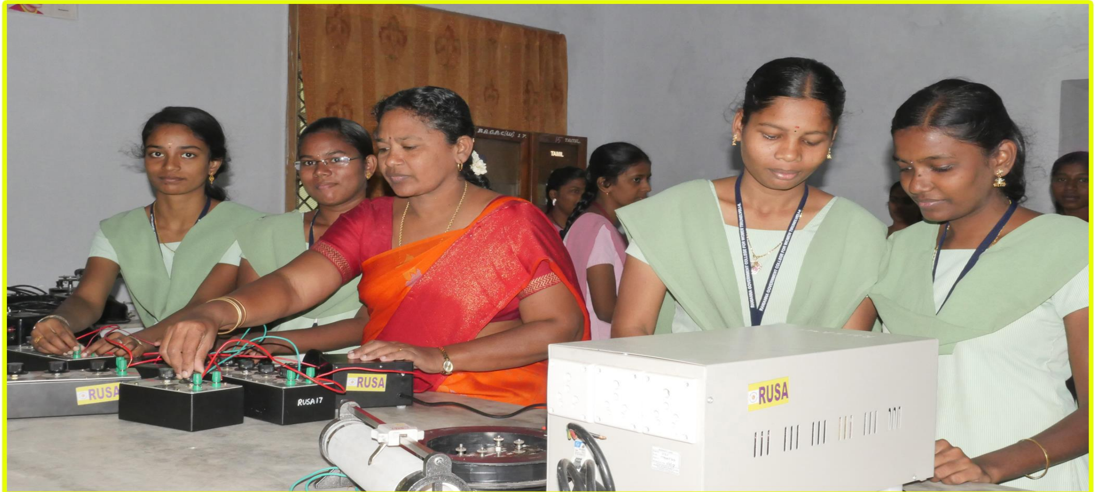
Research Department in Physics