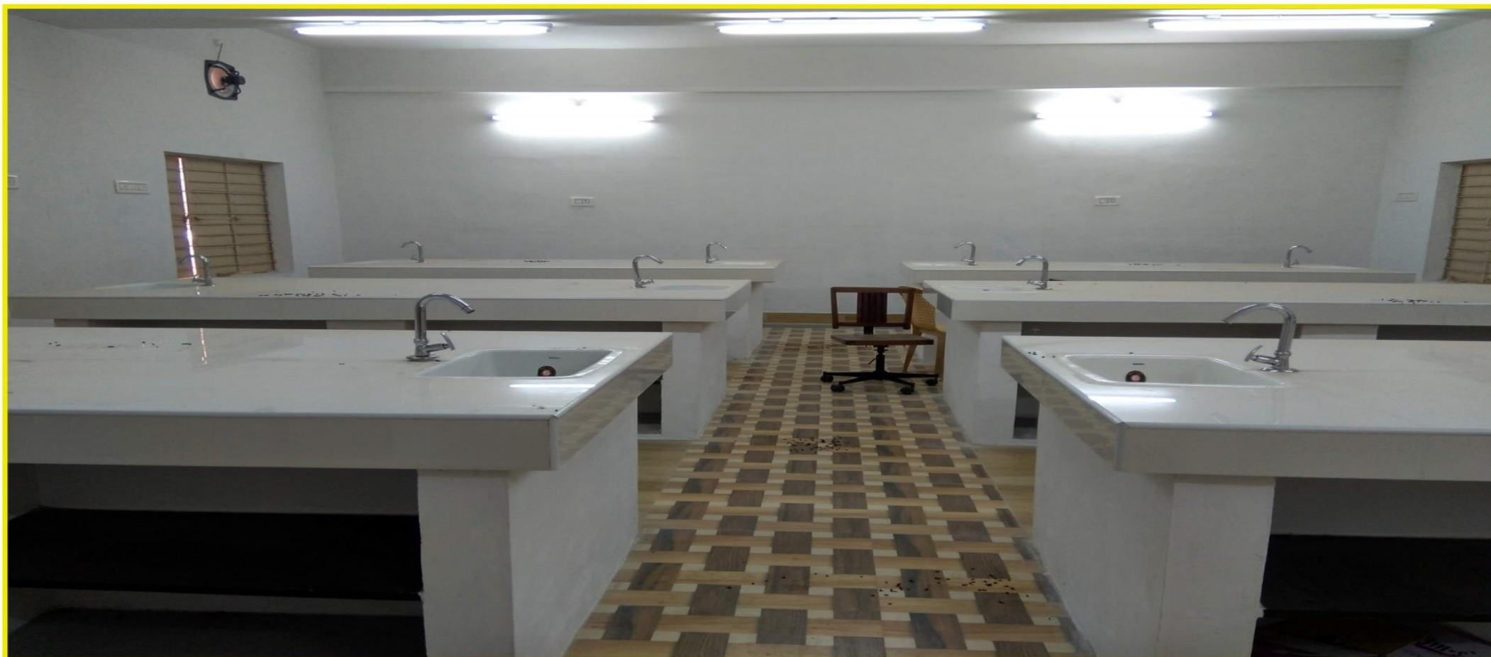
Extension of Chemistry Laboratory